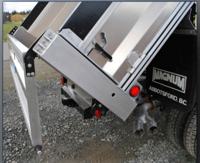
Premium easy opening steel latches and hardware

MANY OPTIONS AND CUSTOMIZATION AVAILABLE ON REQUEST