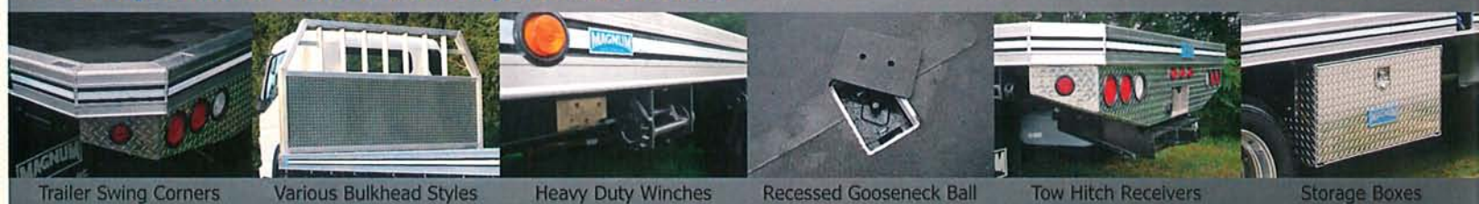
Trailer Swing Corners